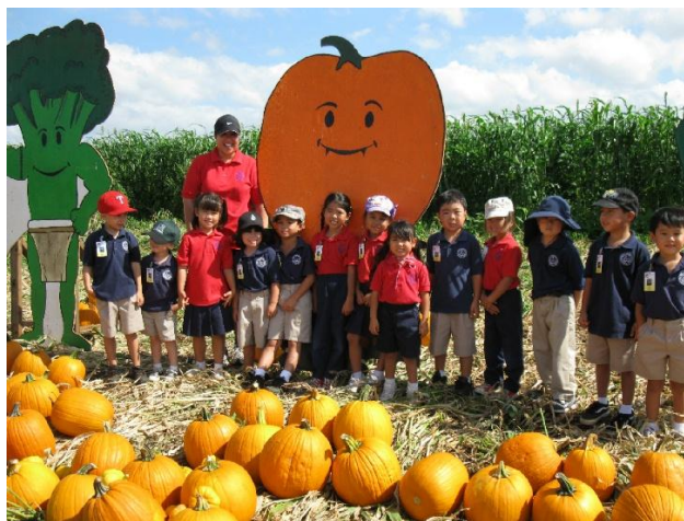
Kindergarteners enjoy their field trip to the pumpkin patch!