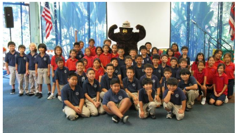
Elementary students welcome Smokey Bear to The Children's House