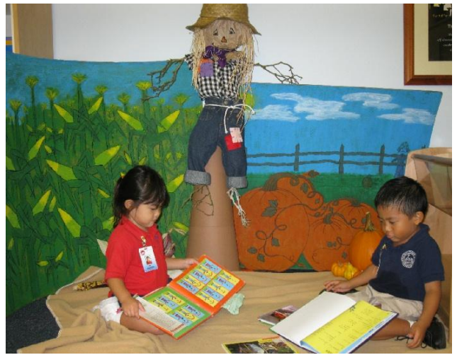
Our preschoolers enjoy looking at their books