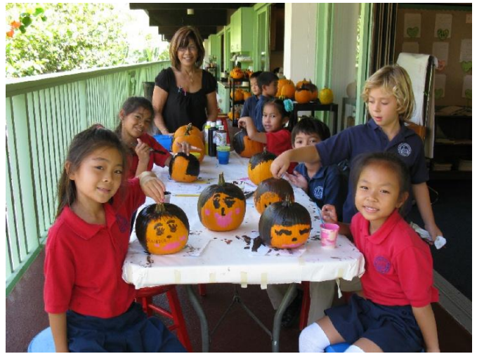
Our elementary students proudly display their hand-painted pumpkins in anticipation of Harvest Day festivities!