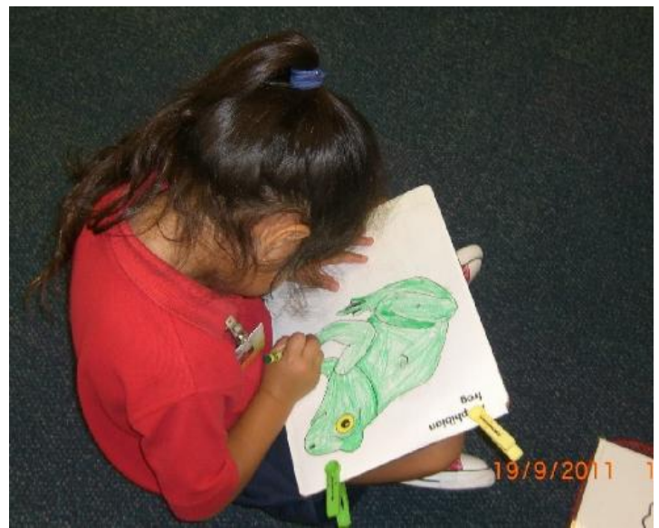
One of our kindergarteners learning the parts of a frog and doing a beautiful job coloring the frog