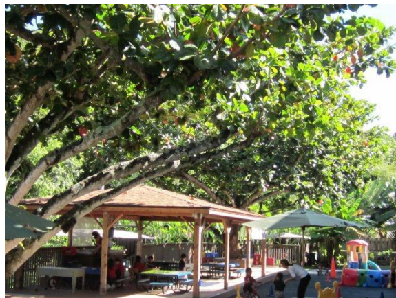
Our beautiful outdoor environment