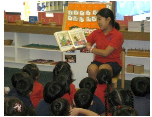
One of our sixth grade students reading a story to the preschoolers