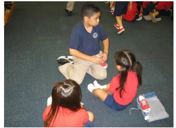
An elementary student helps preschoolers after nap time