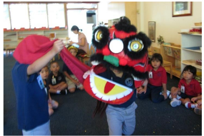
Preschoolers welcome the Year of the Dragon!