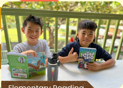
Elementary Reading Time