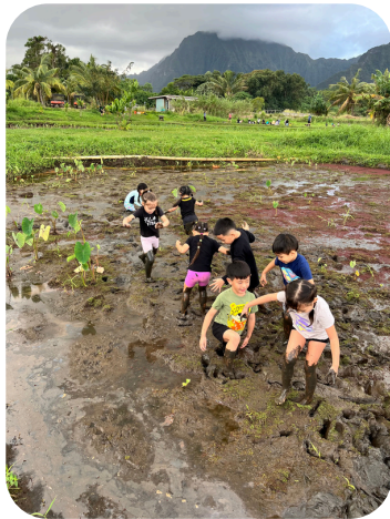
Kindergarten Field Trip to Kako'o Oiwi ~ Our job was to help hehi the kalo lo'i. We worked together to stomp in the lo'i, which helps to aerate the soil and mix the organic matter with the existing soil.

Registration Forms along with additional information will be emailed in March. Our Summer School program is available to students who are currently enrolled in the 2025-2026 school year.