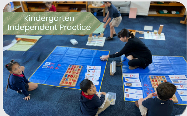
Kindergarten Independent Practice