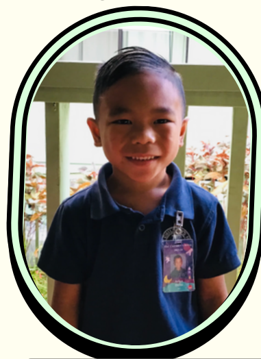
Arius: I like to read Megaladon books. K2