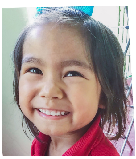
What is your favorite color? My favorite color is pink. (Preschool)