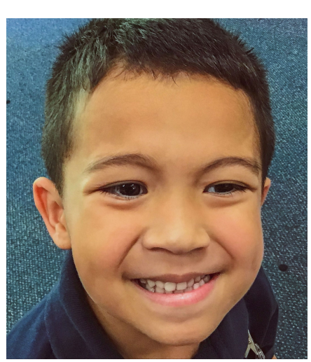
What is your favorite thing about school? My favorite thing about school is recess. (Kindergarten)